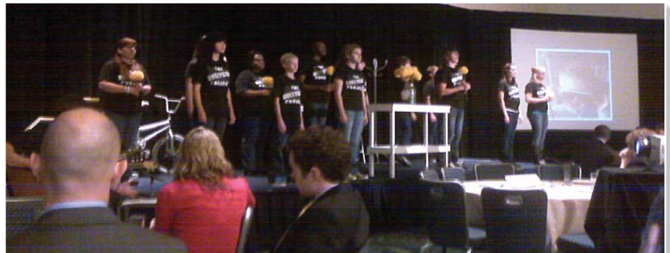
D.C. youth present a musical drama about five victims of bullying who committed suicide as part of the Bullycide campaign.